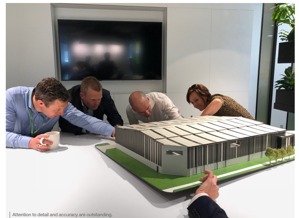
Attention to detail and accuracy are outstanding.