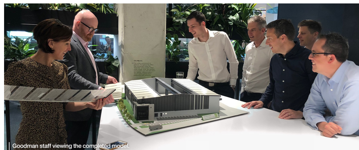
Goodman staff viewing the completed model.